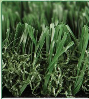
DQ1-8 ( one col)