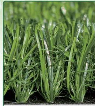
DQ3-15 (2+1 three cols)