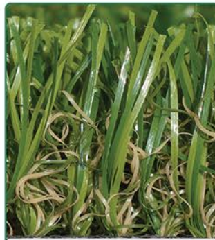
DQ4-9-M (2+2 four cols)