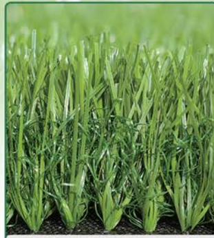
DQ3-12 (2+1 three cols)