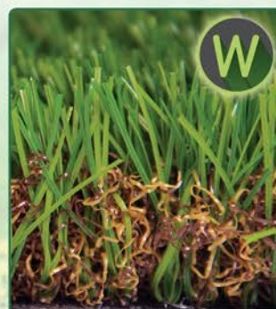
WQ4-1 (2+2 four cols)