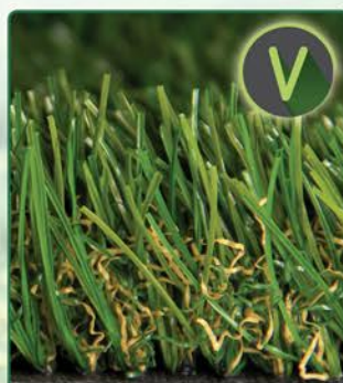
VQ4-2 (2+2 four cols)