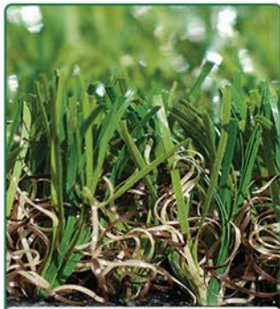
DQ4-6-M (2+2 four cols)