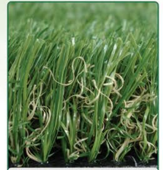
DQ4-1-M (2+2 four cols)