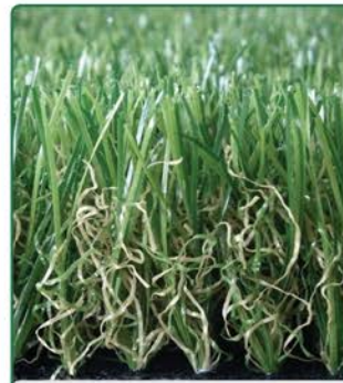
DQ4-28F (2+2 four cols)