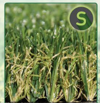
SQ4-1 (2+2 four cols)