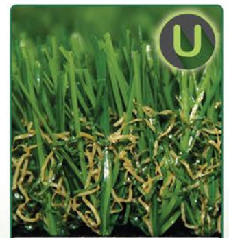
UQ4-11F (2+2 four cols)