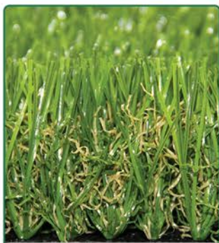
DQ4-42 (2+2 four cols)