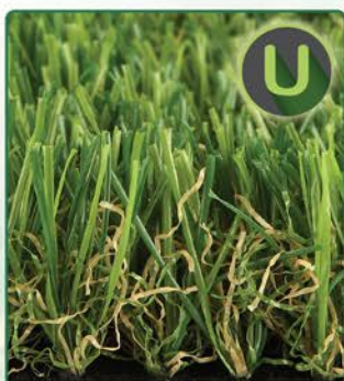
UQ4-13F (2+2 four cols)