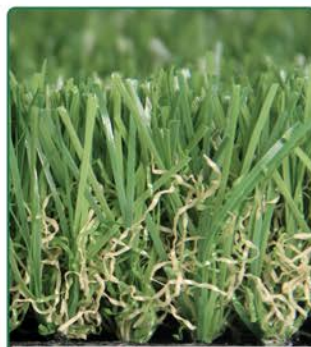
DQ4-56 (2+2 four cols)