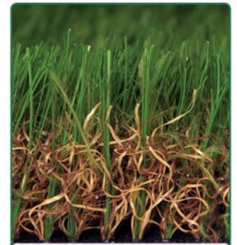
DQ4-63 (2+2 four cols)